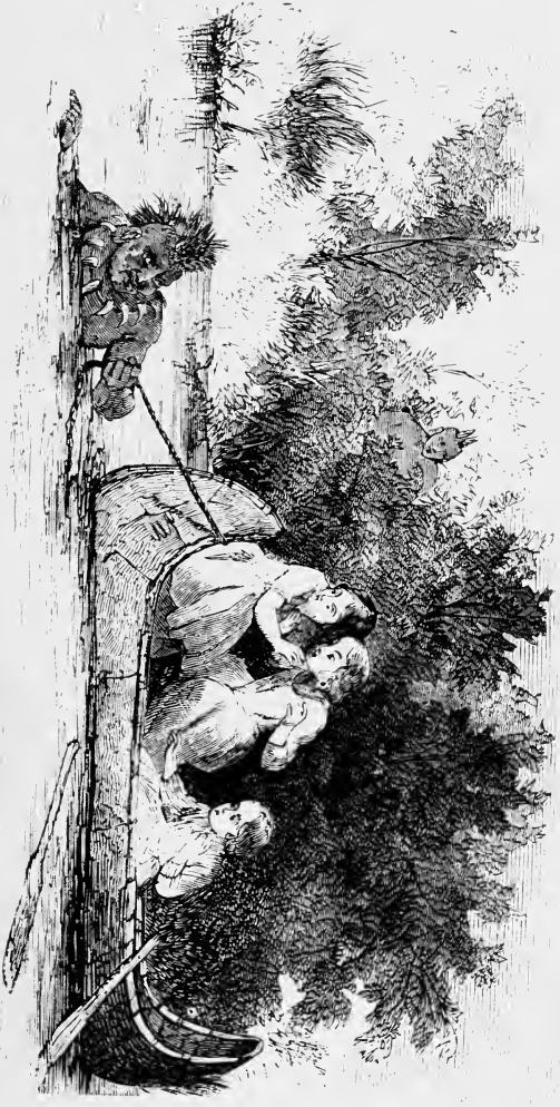
CAPTURE OF BOONE'S DAUGHTER